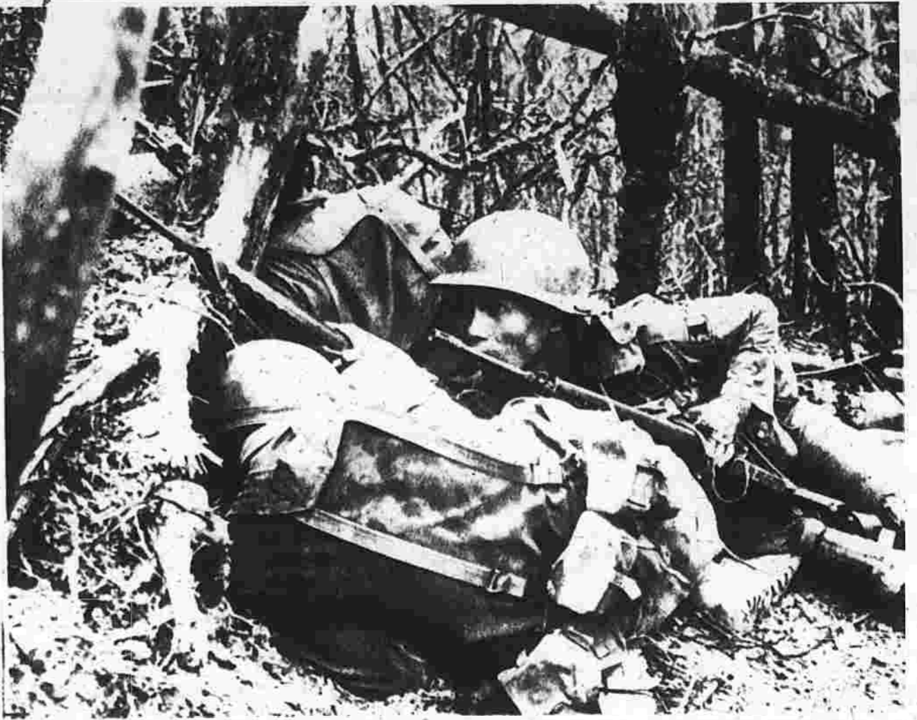
South Vietnamese, under enemy fire, take cover behind a tree trunk west of Hue.