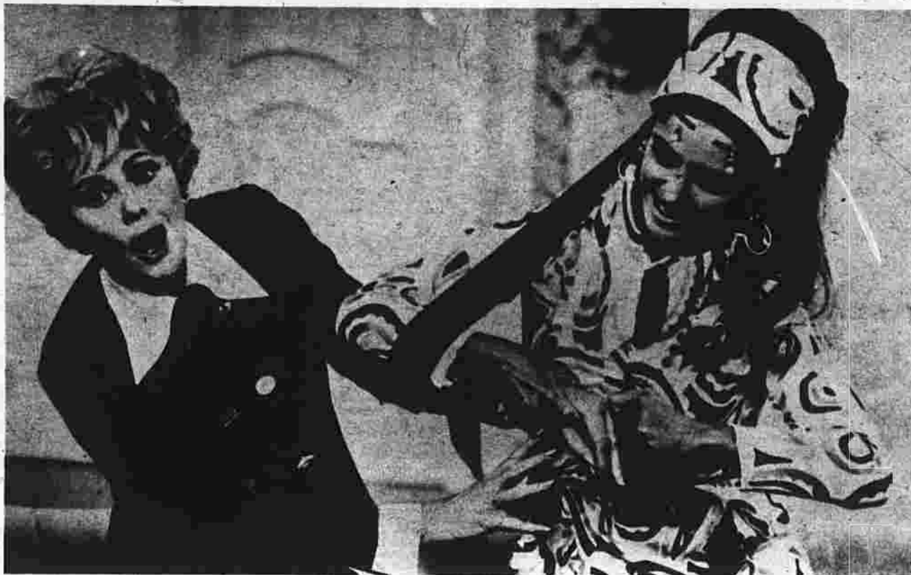
Rocky situation arises over Liz Taylor's fabulous new diamond as Miss Taylor guest stars with husband, Richard Burton on premiere of "Here's Lucy" Sept. 14 (CBS). Lucille Ball has possession in this scene.