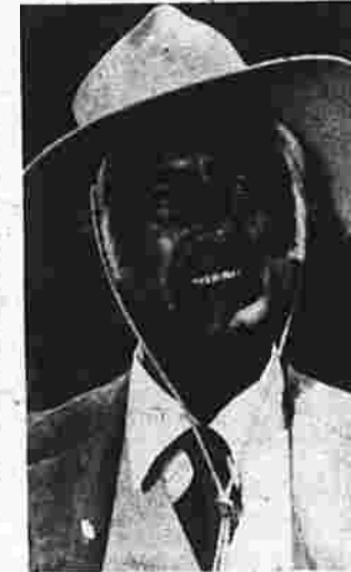
Stewart Granger will join "The Men from Shiloh" series starting Sept. 16.

1:00 (3) Virginia Graham Show (C) (8) Mike Douglas Show (C) (38) Tales of Wells Fargo (C) (48) All My Children (C) (3) As the World Turns (C) (38) Life with Linkletter (C) (8-40) Let's Make a Deal (C) 2:00 (3) Love Is a Many Splendored Thing (C) (38) Days of Our Lives (C) (8-40) Newlywed Game (C) (3) Guiding Light (C) 2:30 (3) The Doctors (C) (8-40) Dating Game (C) 3:00 (3) Beverly Hillsbillies (C) (38) Another World—Bay City (C) (8-40) General Hospital (C) 3:30 (3) Family Affair (C) (38) Bright Promise (C) (8-40) One Life to Live (C) 4:00 (3) Ranger Station (C) (38) Another World—Somerset (C) (8-40) Dark Shadows (C) 4:30 (3) Hazel (C) (8) David Frost Show (C) (18) Early Show (C) "Escape from the Iron Curtain" John Bentley, Theodore Bickel. (38) Mr. Ed (C) (40) Flintstones (C) 5:00 (3) Perry Mason (C) (38) Addams Family (C) (40) Gilligan's Island (C) 5:25 (40) Weather Watch (C) 5:30 (38) Gilligan's Island (C) (40) What's My Line? (C) 5:50 (18) Sewing Show (C) 6:00 (3-8) Weather — Sports and News (C) (18) Westerners (C) (8-40) To Tell the Truth (C) (40) News (C) 6:05 (40) Rawhide (C) 6:30 (3) News with Walter Cronkite (C) (8) News with Frank Reynolds and Howard K. Smith (C) (18) Dick Van Dyke (C) (38) NBC News (C) (38-40) Death Valley Days (C)